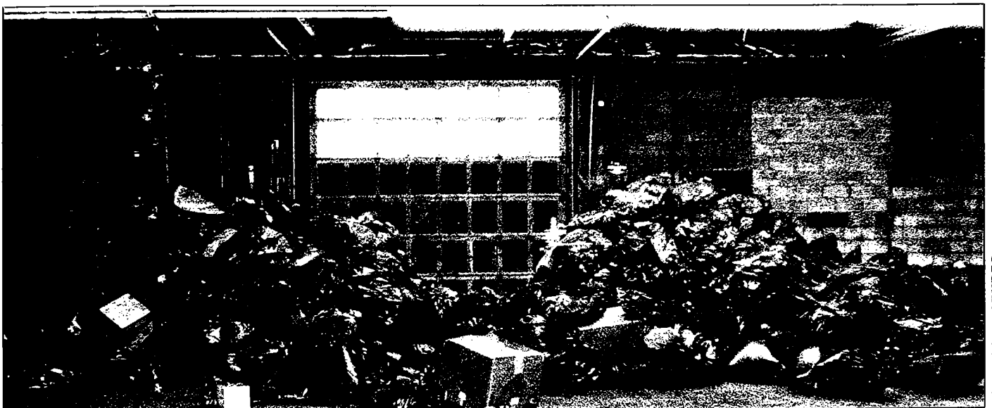
Rebagged medical waste was illegally stored here by a contracted hauler and then put out for general collection.

EPA has not yet determined whether this provision prevents pretreated discharges to sewers. Arguably, pretreated medical waste is no longer prohibited waste and can thus be discharged into publicly owned treatment works (POTWs). However, EPA is concerned that pretreatment of medical wastes may not meet the proper standard. Although EPA is reportedly planning new rules on this issue,